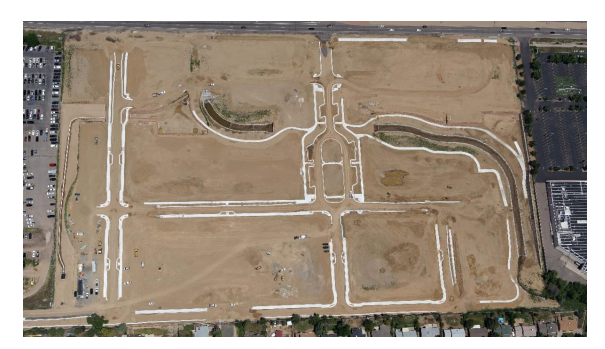
CITADEL ON COLFAX SUBDIVISION PHASE 1