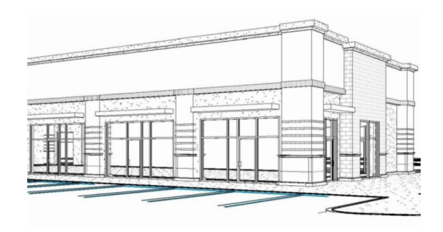
VISTA HIGHLANDS LOT 9 Location: Broomfield Started: July 2019 Architect: Naos Design Group

BIG SPLASH CARWASH Location: Colorado Springs Started: Nov 2019 Architect: Howa Design