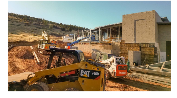
LOVELAND FIRE STATION NO. 7 Location: Loveland Started: April 2019 Architect: Belford Watkins Group