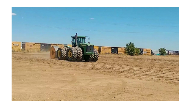
GWIP - BROE OFFSITE Location: Windsor Started: Sept 2019 Architect: (n/a)