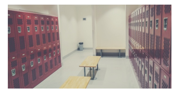
LOVELAND CLASSICAL SCHOOLS LOCKER ROOMS Location: Loveland Architect: Hord Coplan Macht