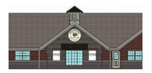
PRIMROSE DAYCARE CANDELAS Location: Arvada Started: Oct 2019 Architect: Galloway & Company