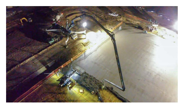
LCC AT CTC BUILDING C Location: Louisville Started: July 2019 Architect: Intergroup Architects