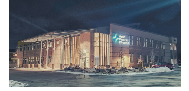
BCH CMC MEDICAL OFFICE BUILDING #2 Location: Lafayette Architect: Boulder Associates

INDIANA PLAZA CORE & SHELL AND HEARTLAND DENTAL TENANT FINISH Location: Arvada Architect (C&S): nama partners Architect (TI): SEH Architects