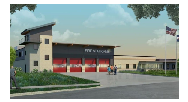
GREELEY FIRE STATION NO. 6 Location: Greeley Started: Nov 2019 Architect: SEH, Inc.