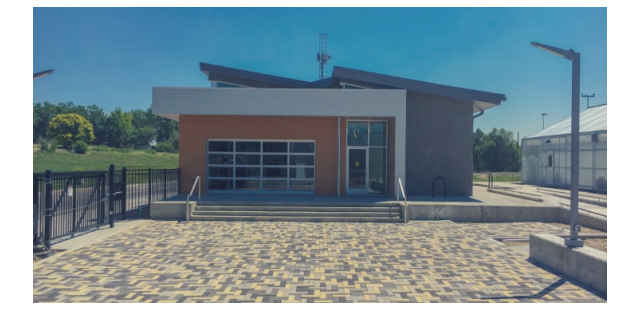
WESTMINSTER GREENHOUSE AND ADMIN BUILDINGS (ENGLAND PARK GREENHOUSE CENTER) Location: Westminster Architect: D2C