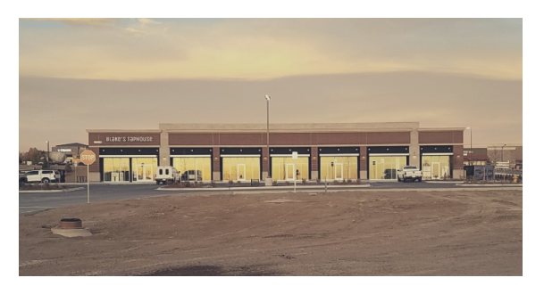
VISTA HIGHLANDS - SITE IMPROVEMENTS AND RETAIL CORE & SHELL LOTS 3 AND 5 Location: Broomfield Architect: Naos Design Group