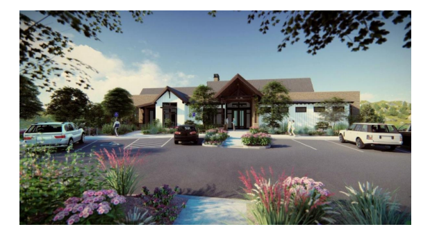
MONTAINE ADULT AMENITIES CLUBHOUSE Location: Castle Rock Started: Feb 2020 Architect: DTJ Design