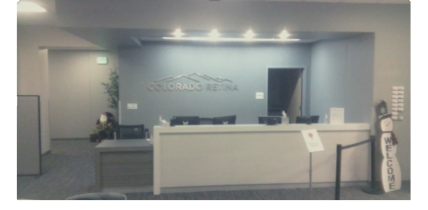
BCH CMC MOB 2 COLORADO RETINA LAFAYETTE TI Location: Lafayette Architect: Boulder Associates