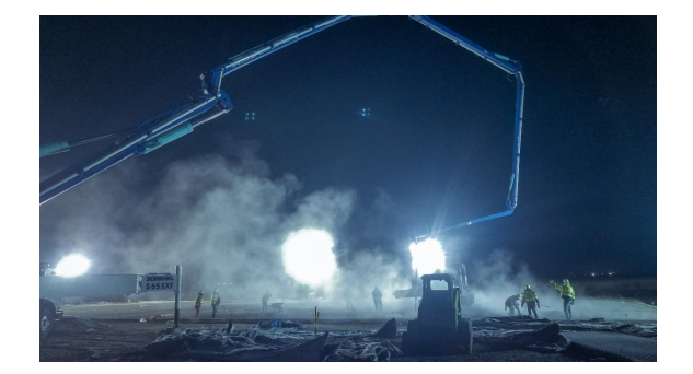
CENTERRA INDUSTRIAL BUILDING NO. 5 Location: Loveland Started: Sept 2019 Architect: Ware Malcomb