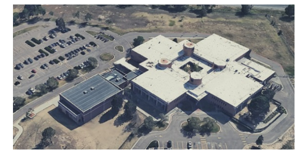
DPS SAMSONSITE HIGH SCHOOL RENOVATION Location: Denver Architect: CannonDesign