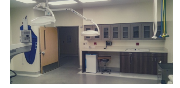
BCH CMC MOB 2 PREMIER EYE SURGERY CENTER