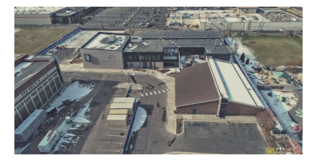
DPS KIPP SUNSHINE PEAK ACADEMY Location: Denver Architect: Cuningham Group