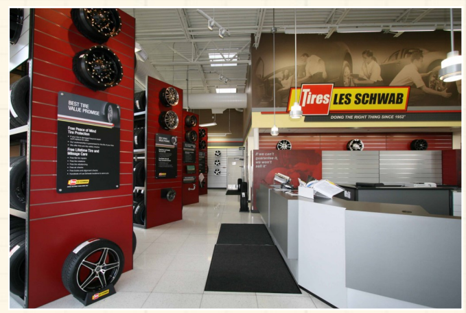
Les Schwab Tire Center, Longmont | GBD Architects, Inc.