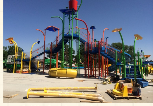
Del Mar Park Aquatic Center , Aurora Ohlson Lavoie Collaborative