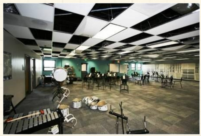
Fort Lupton Middle School | Anderson Hallas Architects, PC