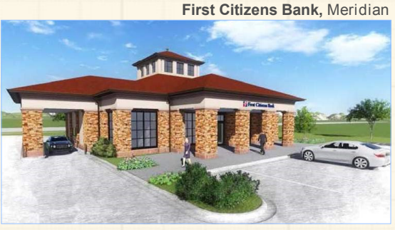
Davis Partnership Architects