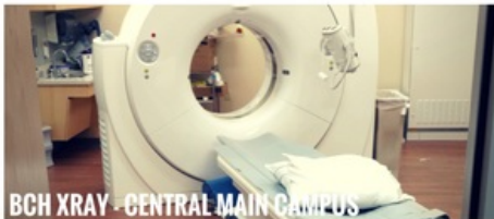
BCH XRAY - CENTRAL MAIN CAMPUS Location: Boulder Architect: Boulder Associates