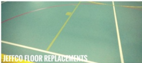
JEFFCO FLOOR REPLACEMENTS Locations: Arvada, Denver, Lakewood, Indian Hills Architect: Anderson Hallas Architects