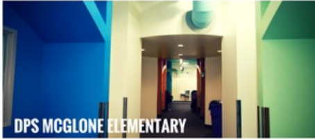
DPS MCGLONE ELEMENTARY Location: Denver Architect: DLH Architecture