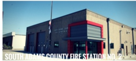
SOUTH ADAMS COUNTY FIRE STATION NO. 2 Location: Commerce City Architect: Allred & Associates