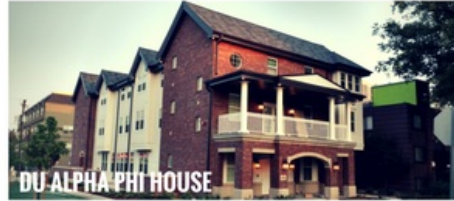
DU ALPHA PHI HOUSE Location: Denver Architect: Cunningham & Associates