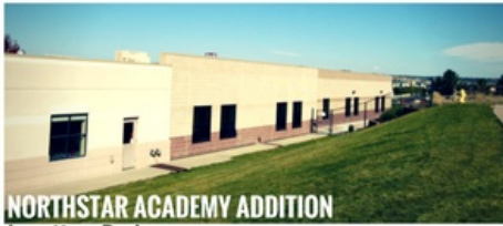
NORTHSTAR ACADEMY ADDITION Location: Parker Architect: Hord Coplan Macht