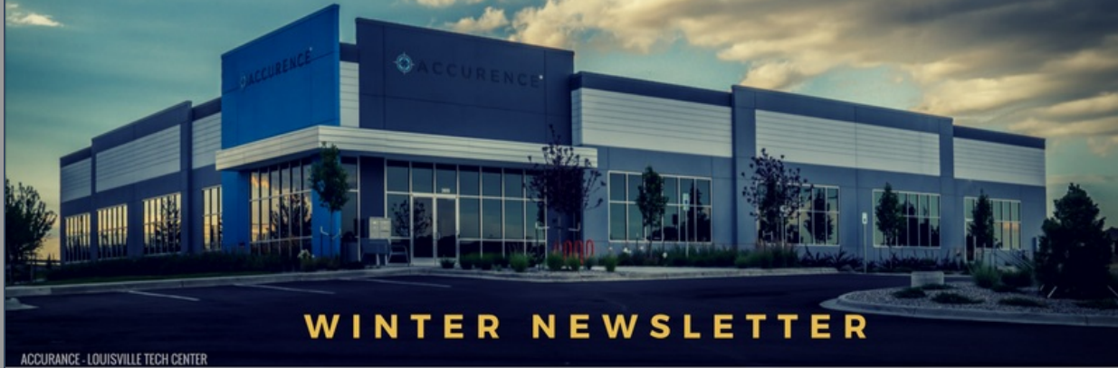
ACCURENCE - LOUISVILLE TECH CENTER

A LOOK AT PROJECTS WE FINISHED IN 2017 AND A LOOK AT WHAT 'S COMING IN 2018