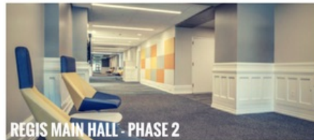
REGIS MAIN HALL - PHASE 2 Location: Denver Architect: Bennett Wagner & Grody