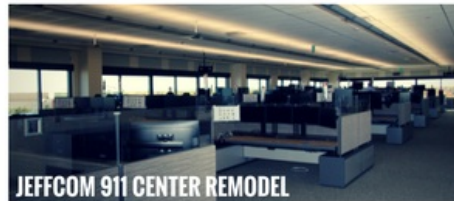
JEFFCOM 911 CENTER REMODEL Location: Lakewood Architect: Wold Architects and Engineers